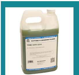
1-gallon jug SKU: VHPE210/1 UPC-12: 641238012016