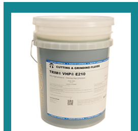
5-gallon pail SKU: VHPE210/5 UPC-12: 641238012047