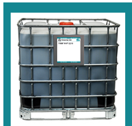
270-gallon tote SKU: VHPE210/NR270P UPC-12: 641238034285