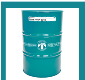
54-gallon drum SKU: VHPE210/54 UPC-12: 641238012054